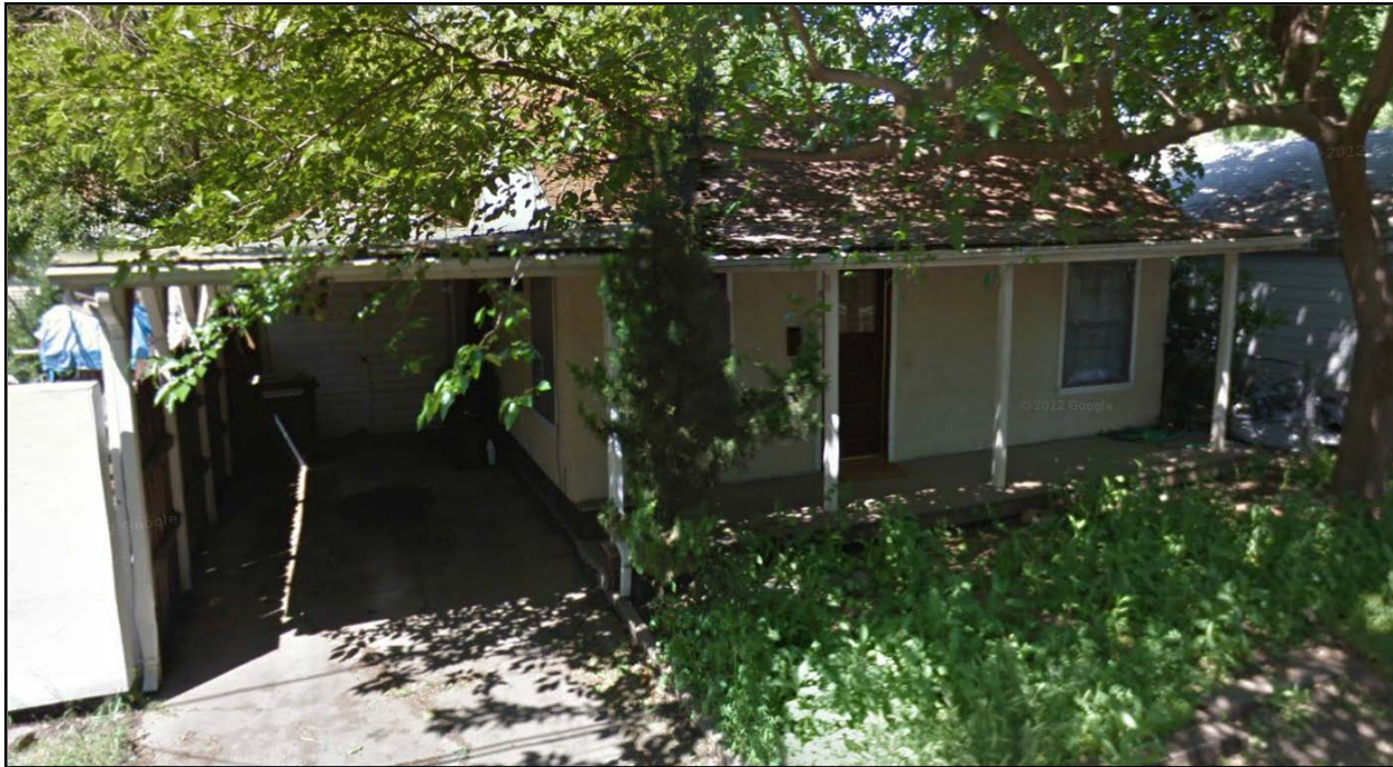
Project Site – 860 Virginia Street

The subject unincorporated parcel, which is approximately 2,240 square feet (0.05 acres) in size, is developed with a 672 square foot, 1-bedroom single-family dwelling unit built in 1950. Domestic water is provided by the California Water Service Company. The parcel fronts on Virginia Street, which is a public road. Virginia Street is paved but is not improved with curbs, gutters, or sidewalks. Land use on the surrounding parcels is single-family residential dwellings on lots ranging in size from 0.08 to 0.25 acres.