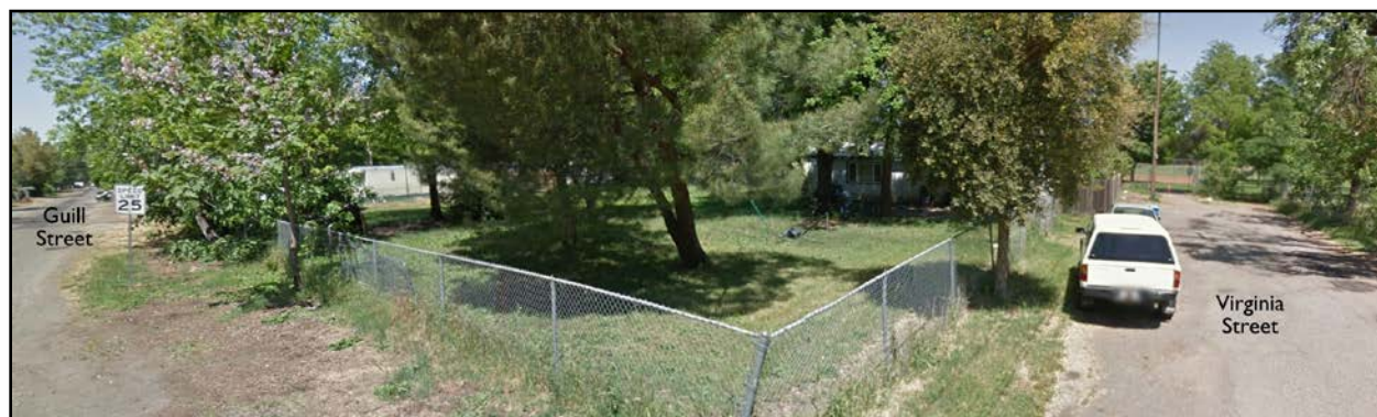
Project Site – 1060 Virginia Street

The subject unincorporated parcel, which is approximately 17,750 square feet (0.41 acres) in size, is developed with a 1-bedroom, 1-bath, 936 square foot conventionally built structure built in 1946. Domestic water supply for the dwelling is provided by the California Water Service Company. The parcel is a corner lot and fronts on Virginia Street and on Guill Street, both of which are public roads. Both of these roads are paved but are not improved with curbs, gutters, or sidewalks. Land use on the surrounding parcels includes single-family residential dwellings, on lots ranging in size from 0.15 to 0.5 acres and Community Park.