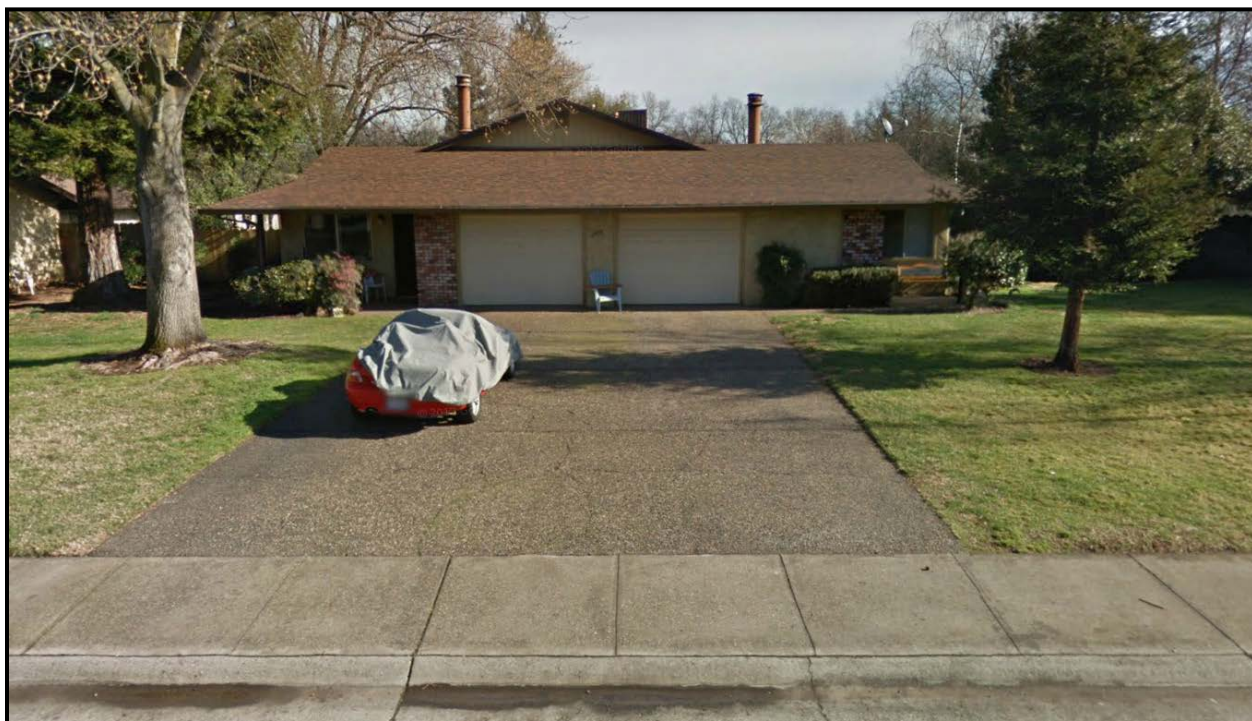
Project Site – 2898 Jolyn Way

The subject unincorporated parcel, which is approximately 13,500 square feet (0.3 acres) in size, is developed with a residential duplex use. The duplex structure is 2,096 square feet in size and consists of two attached dwelling units, each of which has two bedrooms and two bathrooms. Domestic water supply for the duplex is provided by the California Water Service Company. The parcel fronts on Jolyn Way, which is a paved public road that is improved with curbs, gutters, and sidewalks. Land use on the surrounding parcels is primarily residential duplex units on 0.3-acre lots. The parcel to the east of the subject parcel is developed with a 6-acre mobile home park.