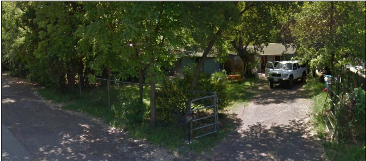
Project Site – 1328 Bruce Street

The subject unincorporated parcel, which is approximately 10,737 square feet (0.25 acres) in size, is developed with a 1,003 square foot, 2-bedroom single-family dwelling unit built in 1948. Sewage disposal for the dwelling is handled by an on-site septic system and domestic water is provided by the California Water Service Company. The parcel fronts on Bruce Street, which is a public road. Bruce Street is paved but is not improved with curbs, gutters, or sidewalks. Land use on the surrounding parcels is single-family residential dwellings on lots ranging in size from 0.24 to 0.4 acres.