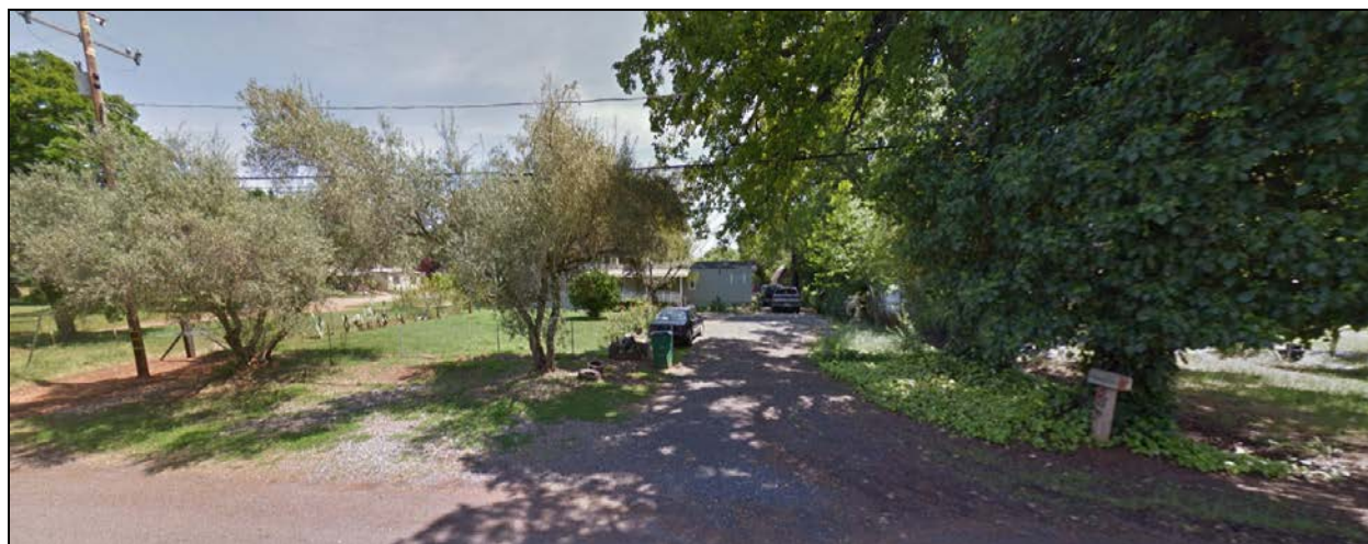
Project Site – 7049 Railroad Avenue

The territory is zoned VLDR (Very Low Density Residential) by Butte County and the Butte County General Plan designates the territory as Very Low Density Residential, which allow for a density of one dwelling unit per acre.