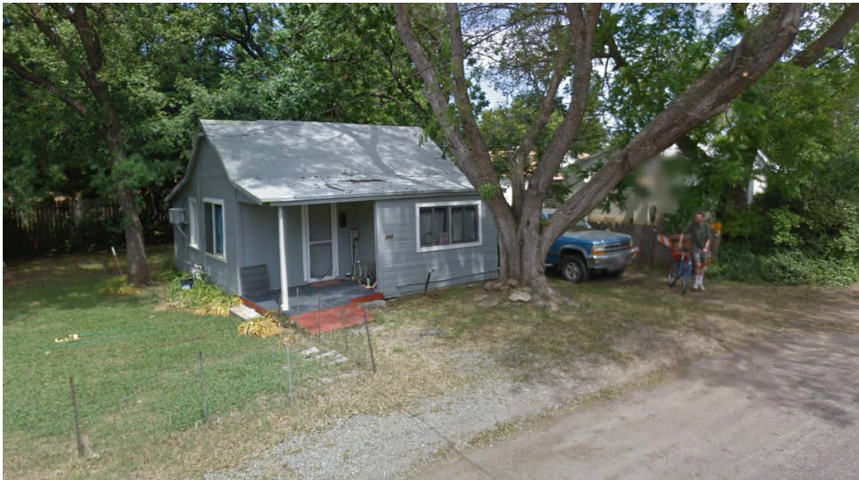
Project Site – 558 East 23 rd Street

The subject unincorporated parcel, which is approximately 3,050 square feet (0.07 acres) in size, is developed with a 1-bedroom, 1-bath, 413 square foot conventionally-built single-family dwelling unit constructed in 1949. Domestic water supply for the dwelling is provided by the California Water Service Company. The parcel fronts on East 23 rd Street, which is a public road. East 23 rd Street is paved but is not improved with curbs, gutters, or sidewalks. Land use on the surrounding parcels is single-family residential dwellings on lots ranging in size from 0.06 to 0.14 acres.