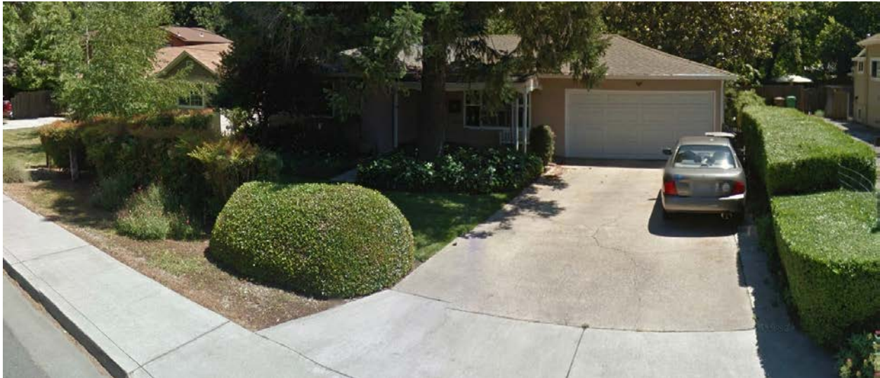
Project Site – 710 Oak Lawn Avenue

The subject unincorporated parcel, which is approximately 9,034 square feet (0.2 acres) in size, is developed with a 3-bedroom, 1-bath, 1,080 square foot conventionally-built single-family dwelling unit constructed in 1957. Domestic water supply for the dwelling is provided by the California Water Service Company. The parcel fronts on Oak Lawn Avenue, which is a public road that is improved with curbs, gutters, and sidewalks. A City of Chico sewer line is located within the Oak Lawn Avenue right-of-way. Land use on the surrounding parcels is single-family residential dwellings on lots ranging in size from 0.15 to 0.45 acres.