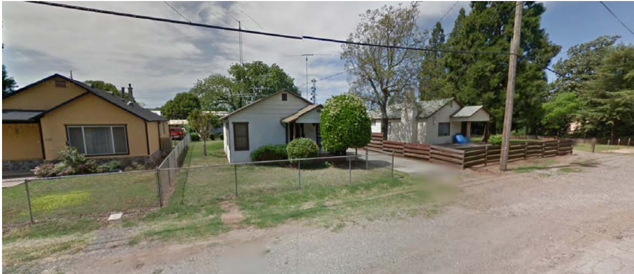
Project Site – 2174 Mulberry Street

The subject unincorporated parcel, which is approximately 6,100 square feet (0.14 acres) in size, is developed with a 2-bedroom, 1-bath, 672 square foot conventionally-built dwelling unit built in 1952, and a detached garage. Domestic water supply for the dwelling is provided by the California Water Service Company. The parcel fronts on Mulberry Street, which is a public road. Mulberry Street is paved but is not improved with curbs, gutters, or sidewalks. Land uses on the surrounding parcels include single-family dwellings and a commercial use.