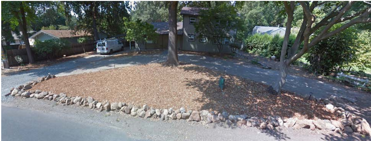
Project Site – 85 Rose Avenue

The subject parcel, which is approximately 40,000 square feet (0.92 acres) in size, is developed with a 4-bedroom, 2-bath, 2,324-square foot single-family dwelling built in 1960. Domestic water supply for the dwelling is provided by the California Water Service Company. The parcel fronts on Rose Avenue, which is a public road that is paved but which is not improved with curbs, gutters, or sidewalks. Land uses on the surrounding parcels are single-family dwellings.