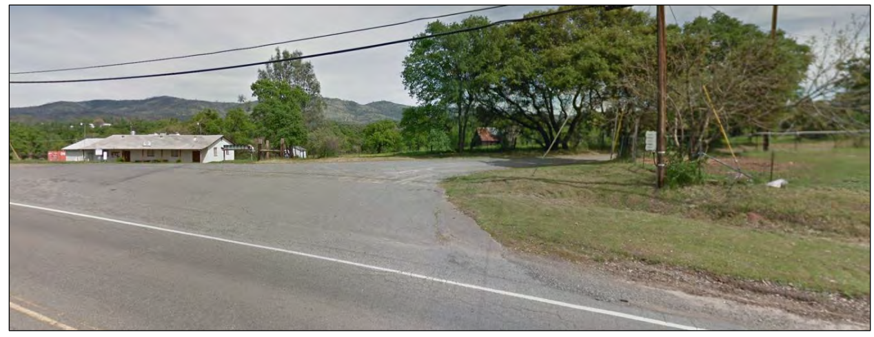
Foothill Boulevard at residence driveway

The annexation territory is accessed by a private drive from Foothill Boulevard. The site is zoned RR-5 (Rural Residential with 5 acre minimum lot size) and identified as RR (Rural Residential) by the Butte County General Plan. The Rural Residential land use designation is most appropriate for single-family development at rural densities of 1 dwelling unit per 5 acres, small farmsteads, and accessory dwelling units.