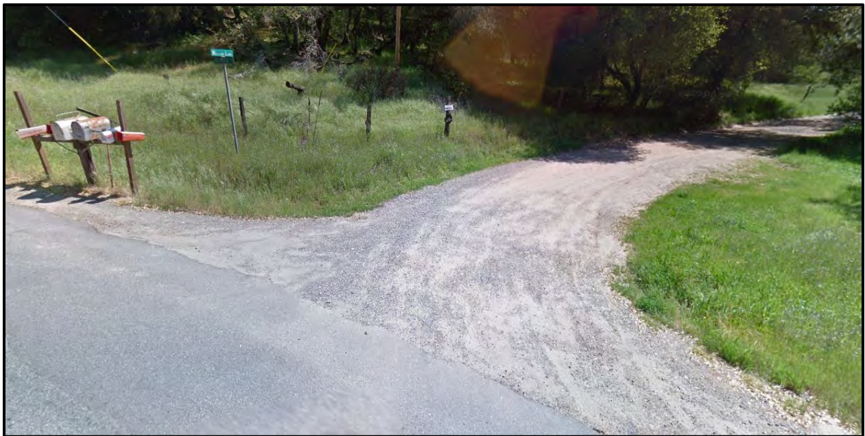
Milligan Lane at La Porte Road

The annexation territory is accessed by Milligan Lane, a private gravel lane serving five parcels. The Butte County General Plan designates the annexation territory as AG (Agriculture) and zoning is AG-40 (Agriculture, 40-acre minimum lot size). This land use designation allows the cultivation, harvest, storage, processing, sale, and distribution of plant crops, as well as roadside stands for the sale of agriculture products grown or processed on the property. Residential uses in the agriculture land use designation are limited to one single-family dwelling and one second dwelling unit per legal parcel.