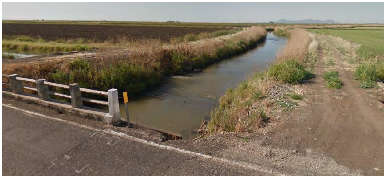
Little Dry Creek at Richvale Highway

DD2 does not own or lease any lands, major facilities, or equipment. Little Dry Creek is not owned by the district. Rather, easements held across private property provide DD2 access to the creek for maintenance and operation purposes. DD2 has no employees and contracts its maintenance duties out to various outside vendors.